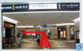
6 Turn left at the T-junction, Escalator down to the first floor concourse.