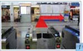
1 Turn right at the exit east Tokaido JR. (Please see the guide 4) right out of the mouth to the center in the case of Shinkansen