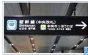
4 Shinkansen central mouth, towards the middle Ticket Office.