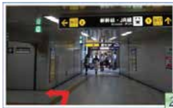
2 I got off the subway exit 2.