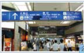
2 I continue towards the west exit.