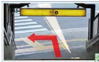
3 I cut down the stairs to the left.