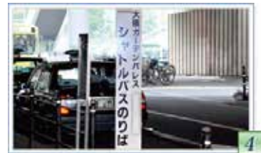
4 I arrived at the shuttle bus.