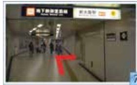
8 On the right side of the subway Midosuji I go down the stairs Exit 2.