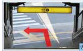
9 I cut down the stairs to the left.