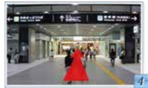
5 I go to the north exit Shin Hankyu Building. Shinkansen is the right direction from the central exit.