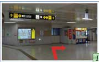
1 Exit north Midosuji subway Please toward Exit 2.