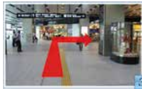
3 Shinkansen central mouth, towards the middle Ticket Office.