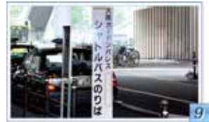
10 I arrived at the shuttle bus.